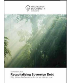
Recapitalising Sovereign Debt: Policy Briefing Click to access publication > :vivideconomics

Aligning Development Finance with Nature's Needs Click to access publication > :vivideconomics basic roots consulting