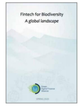
Fintech for Biodiversity: A Global Landscape Click to access publication >