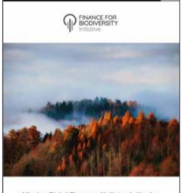
Iobal Finar k for System

Aligning Global Finance With Nature's Needs Click to access publication >